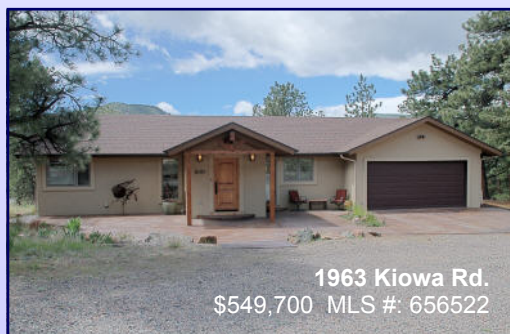
1963 Kiowa Rd. $549,700 MLS #: 656522