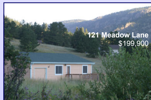
121 Meadow Lane $199,900

MARY MURPHY, COLDWELL BANKER ESTES VILLAGE PROPERTIES (970-586-4425) 970-214-6350 * marymurphy@frii.com