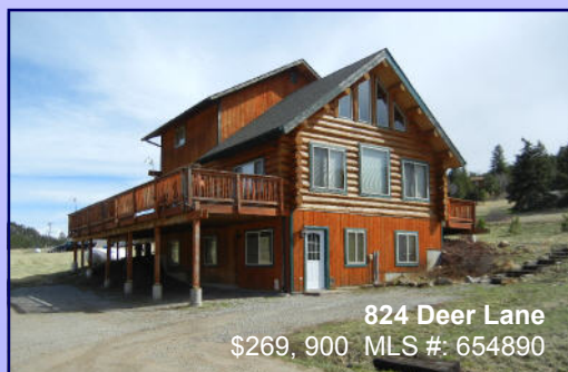
824 Deer Lane $269,900 MLS #: 654890

Enjoy the beautiful expansive views from your front deck. Walk through 2.58 acres of trees, meadows and flowers. This stick built well insulated, low maintenance 2 bedroom /1 bath ranch also features a 1 car garage and plenty of storage for full time residency, rental or a vacation retreat. Home Warranty included.