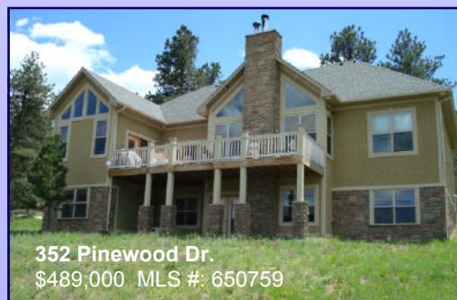
352 Pinewood Dr. $489,000 MLS #: 650759