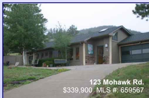
123 Mohawk Rd. $339,900 MLS #: 659567

SCOTT MUNN RE/MAX of BOULDER (303-449-7000) 720-289-8706 * scottmunn@remax.net