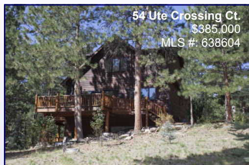
54 Ute Crossing Ct. $385,000 MLS #: 638604

MARK WEBBER ROCKY MOUNTAIN PROPERTY (303-747-1111) 720-291-9812 * mkwebber@msn.com