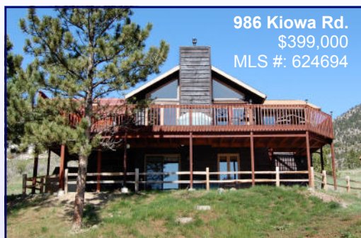
986 Kiowa Rd. $399,000 MLS #: 624694

Cathedral ceilings & sky lights allow light to flow throughout open floor plan. Granite kitchen counters, wood floors, new appliances, tile in kitchen and entryway, new carpet, gas fireplace. Rare mother-in-law apartment in walk-out lower level. Great views from fabulous oversize deck that includes 7 person hot tub.